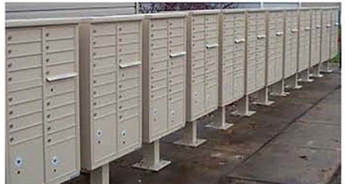
New CBUs accommodate both mail and packages while providing greater security.