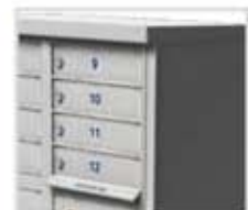
Postal Grey* (PG)