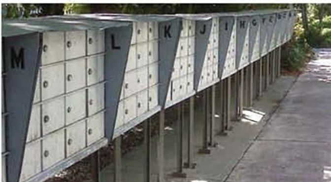
Obsolete NDCBUs are no longer permitted for replacement or new installations.

installation, or create a standalone package center. Florence is proud to be the only USPS Approved manufacturer of the OPL, ensuring the Postal Service can always deliver the packages you or your customers are waiting for the very first time! (see page 8 for product details)